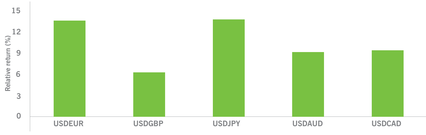
Exhibit A Over the past year, the USD has strengthened significantly versus other developed-market currencies.

Takeaway: There are still many opportunities for dollarbased investors to potentially achieve gains in non-U.S. currencies. In general, we believe it is best to avoid developed-market currencies at this point and to rely on