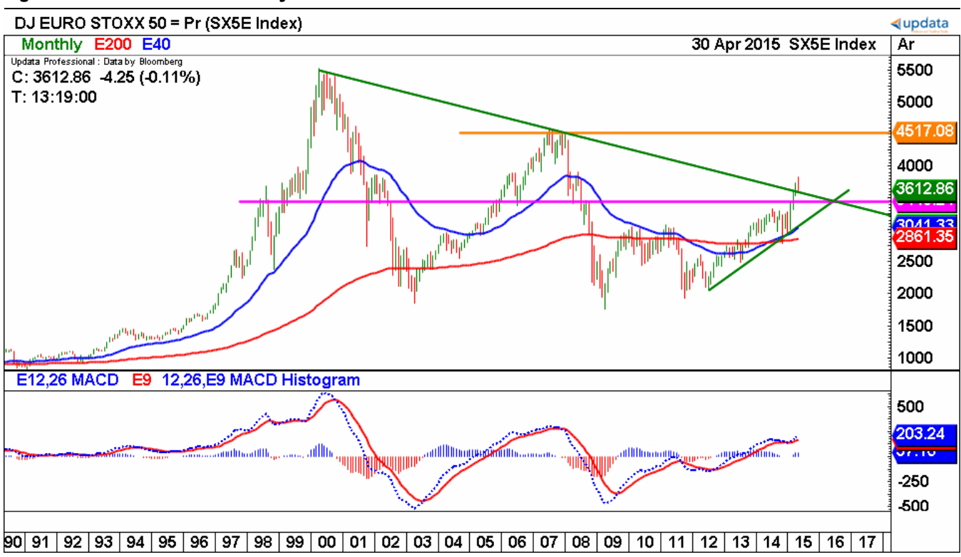
Fig 2 Eurostoxx50 Index monthly chart