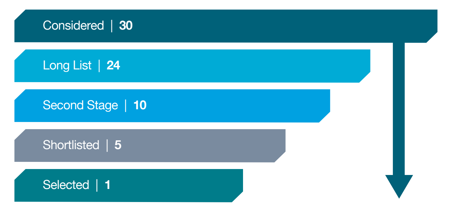
Figure 1: Search at a glance

In addition, the investor strongly preferred systematic versus discretionary strategies, in keeping with their desire for a transparent process. This is highly representative of our client base at present, with investors evidently still in the "love" stage of the quantitative love-hate meta-cycle. One notable limitation was the requirement for pure long-only commodities exposure, eliminating long/short relative value strategies as well as commodity-related equity strategies.