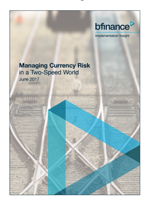
Managing Currency Risk in a Two-Speed World

bfinance Implementation Insight How Have Alternative Risk Premia Strategies Performed? August 2017