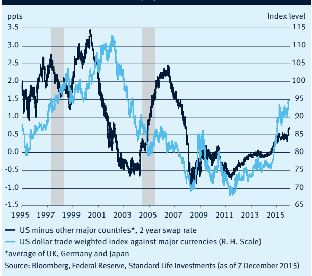
Chart 2 Pulling back on austerity