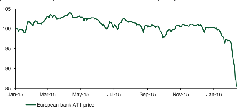
Figure 1: The collapse in banks' additional tier 1 capital prices